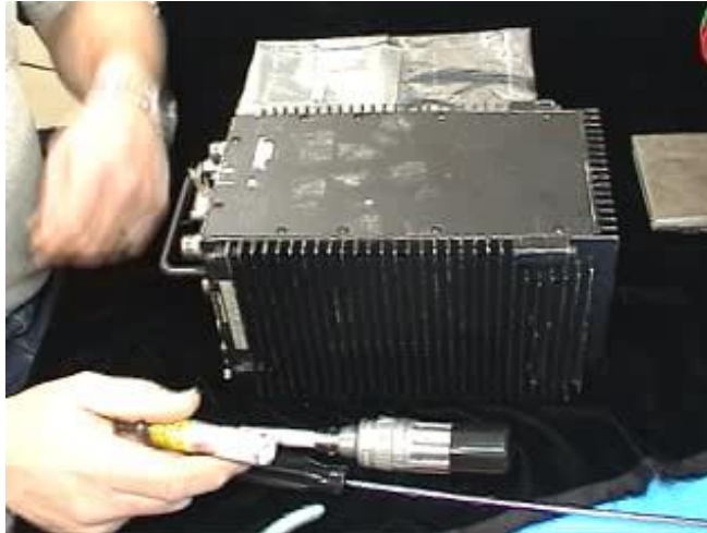
Figure 2 - Screen capture of a maintenance task for the ARC-231 LRU

Training for the ARC-231 was made available by Raytheon in the form of a series of videos that demonstrated the use of the system by highly skilled subject matter experts. While this training did meet the intent, it was lacking in the ease of use and interactivity required by the user to fully understand the capabilities of the radio. The videos provided point solutions to specific tasks, but did not provide any capability to step through procedures, conduct free-play with the radio, or score student progress or activities.