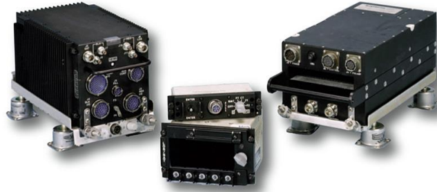
Figure 1 - AN/ARC-231 Radio System

The AN/ARC-231 MARS is not only an airborne VHF/UHF LOS and DAMA SATCOM radio system, but also a multi-band/multi-mission communications suite providing a secure anti-jam voice, data and imagery radio set. The AN/ARC-231 has the following characteristics and capabilities (Chapter 7 Airborne Radios, 2009):