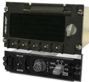
Figure 6 - AN/ARC-231 Simulator Kit Control Indicator and Fill Panel Hardware