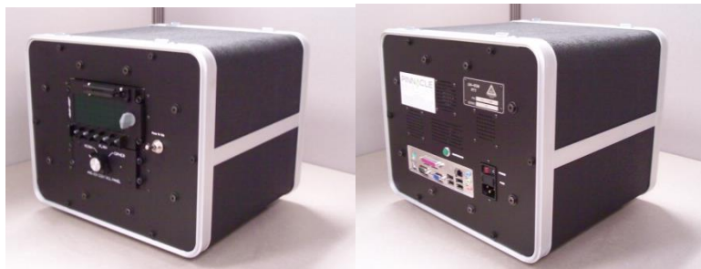
Figure 4 – Pinnacle’s AN/ARC-231 PPT – Front (Left) and Back (Right) Views

Providing a simulated AN/ARC-231 for unit-level use in the classroom filled a need for high fidelity training at a low cost without the issues associated with dealing with COMMSEC equipment.