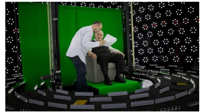
Figure 5 – Subject receiving direction in light stage used for generating 3-D imagery for holographic display

A closer analog may be found in the area of storytelling and gaming. The New Dimensions in Testimony project "allows people to have an interactive conversation with a human storyteller (a Holocaust survivor) who has recorded a number of dialogue contributions (Figure 5), including many compelling narratives of his experiences and thoughts" (Traum et al. , 2015). The project's important mission of preserving the stories of Holocaust survivors can be applied to endless amounts of other important persons and tales. Advances in gaming allow for utilization in learning, entertainment, healthcare, and lifelike training for things like combat and critical thinking. Critical thinking training in the English Language