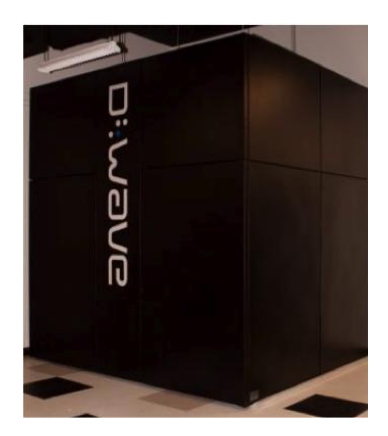
Figure 6. USC-LMC D-Wave

To address VR issues, authors have touted quantum computing's ability to produce more power, using terms like "magic" to stir the imagination and whet the appetites of the user community. They point out that the capability of quantum computers arises from the different way they encode information. Digital computers represent information with transistor-based switches having a