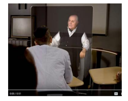
Figure 3 - Video-taped Holocaust Survivor in a holographic display