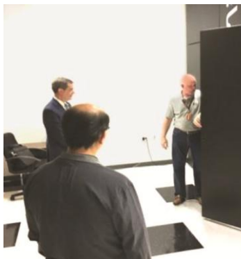
Figure 3. Case size image

that: "... with a suitable class of quantum machines you could imitate any quantum system, including the physical world." (Feynman, 1982). Quantum Computers do not use binary bits; they use qubits, which can represent multiple values simultaneously. This gives an almost unimaginable power in certain areas, but yields only probabilistic results. There is one operational design on the market: while not a general purpose quantum computer, this machine requires extremely cold temperatures (15 milliKelvin) to create a useable quantum effect (Lucas et al. , 2013).