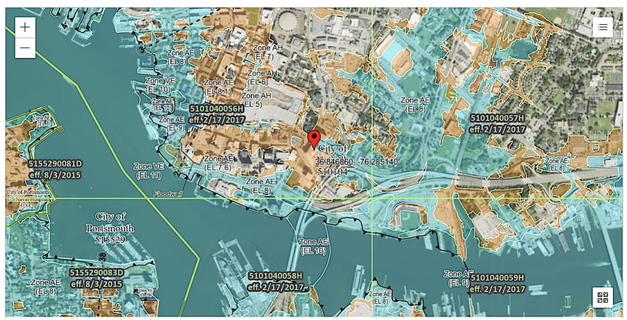
Figure 1: Some of the areas in Hampton Roads, VA with a 1-percent annual chance flood (i.e. 100-year flood zone). These areas are designated in teal as Zone AE and in tan as Zone AH.

Flooding is the most common natural disaster in the U.S. It can cause power outages, disrupt transportation, damage buildings, and create landslides (FEMA, 2024). The Elizabeth River in Hampton Roads, VA poses flood threats to certain communities and businesses. Figure 1 shows that where the threats are greatest for communities and businesses. This occurs in areas identified as 100-year flood zones. An area with a 1-percent annual chance flood is also referred to as the base flood or 100-year flood. In the figure these areas are designated in teal as Zone AE and in tan as Zone AH (Mitchell, 2021; Hunt et al., 2019; Skaggs & Seltzer, 2002). Given this threat we construct risk communications for flooding on the Elizabeth River in our study to reflect the domain of natural hazards.