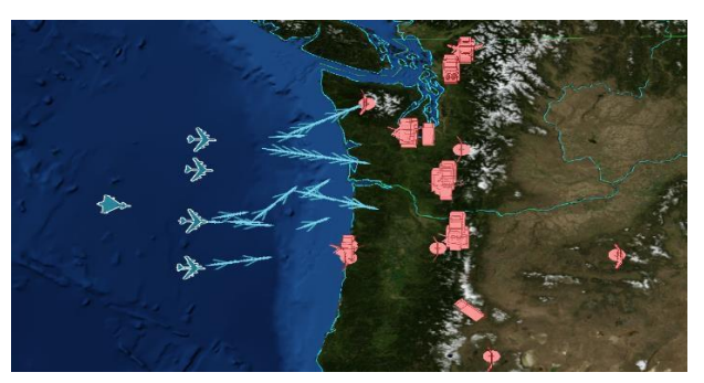
Figure 2. Notional AFSIM scenario

• Optimal Blue Response: Figure 2 shows a notional Advanced Framework for Simulation, Integration, and Modeling (AFSIM) scenario. Incoming blue forces attempt to hit all red targets. In this case, an analyst's objective would be to maximize the number of hits while minimizing the number of blue aircraft used. Using the least number of blue forces has the added benefit of saving on cost while still achieving the mission objective. A typical optimization setup would include varying parameters such as weapon type (categorical variable type), number of weapons (integer variable type), and the amount of time each aircraft has on a target (integer variable type). Running the simulation optimization software utilizes the metaheuristic methodologies described earlier to explore the space and find the optimal response (i.e. reach the analyst's objective).